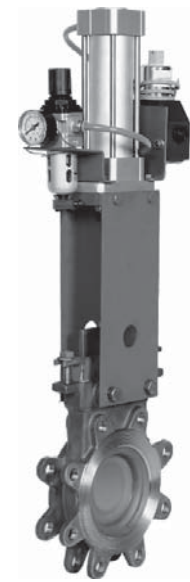
Valve of Cast stainless steel EGNA with pneumatic drive