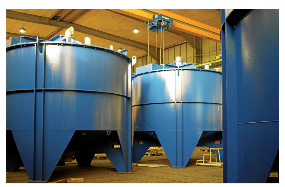
The Lohse waste pulpers during production.

The BTS company, located in the South Tyrolean city of Bruneck, commissioned LOHSE to manufacture a complete wet processing system for organic waste, to be used in Bari. The total order volume