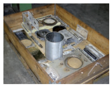
Dismantling and damage report

We now provide exactly the same warranty for your repaired valves as for a new valve!