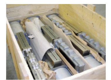
As-new, repaired valve