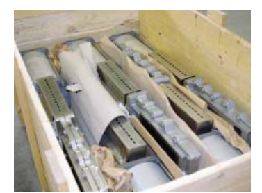
As-new, repaired valve