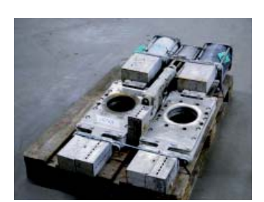
Goods inwards check