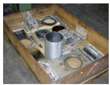
Dismantling and damage report